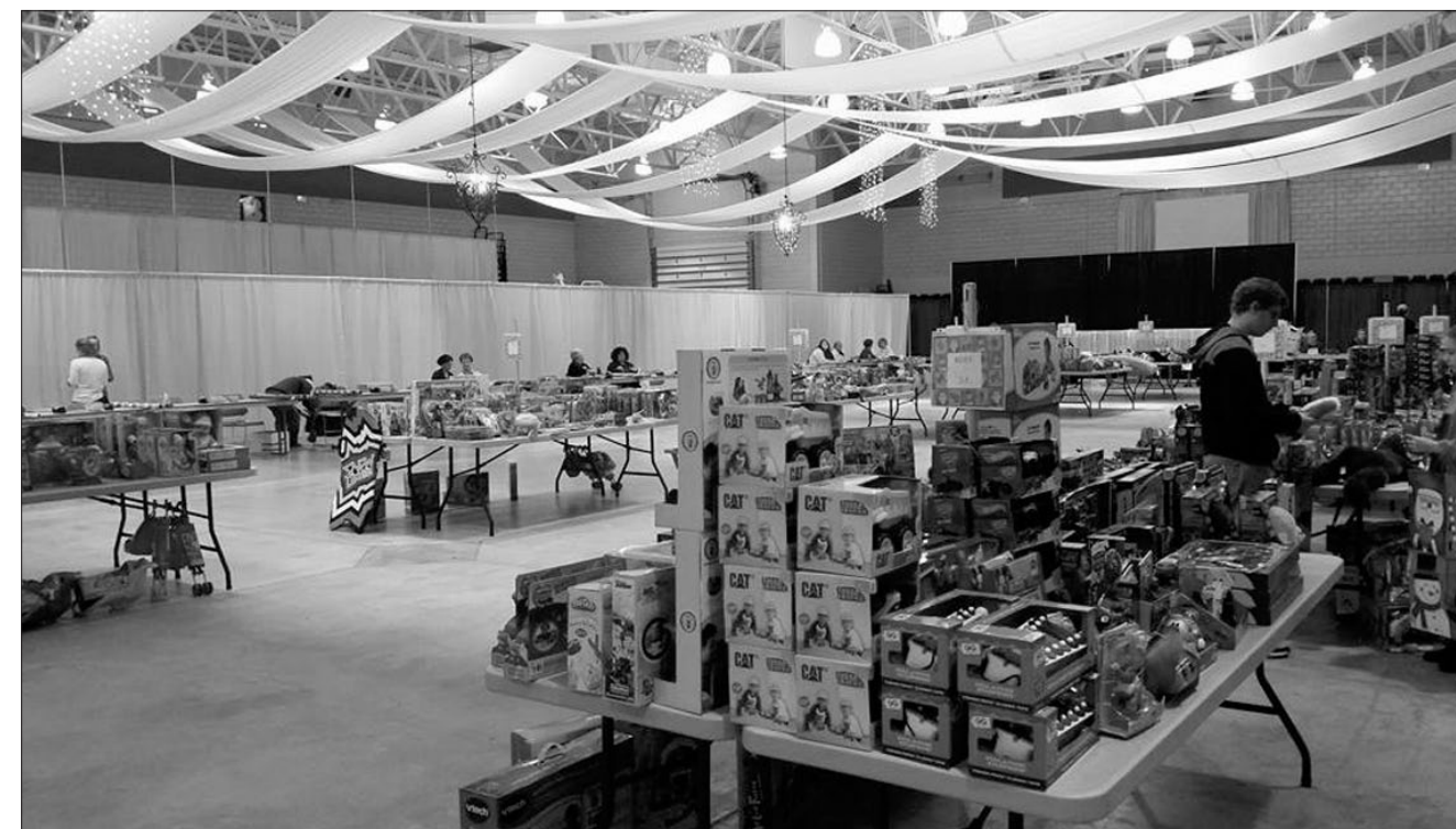
The Summersville Christmas Store